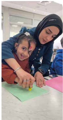
A young girl enjoys a crafting session for Mother's Day at the Jerusalem Princess Basma Centre.

Health services for disabled children in the West Bank are limited, especially for those from disadvantaged families and rural areas. We pray for The Jerusalem Princess Basma Centre, which works with Community Based Rehabilitation Centres to build capacity and expertise, so that children from across the West Bank have access to timely and appropriate care.